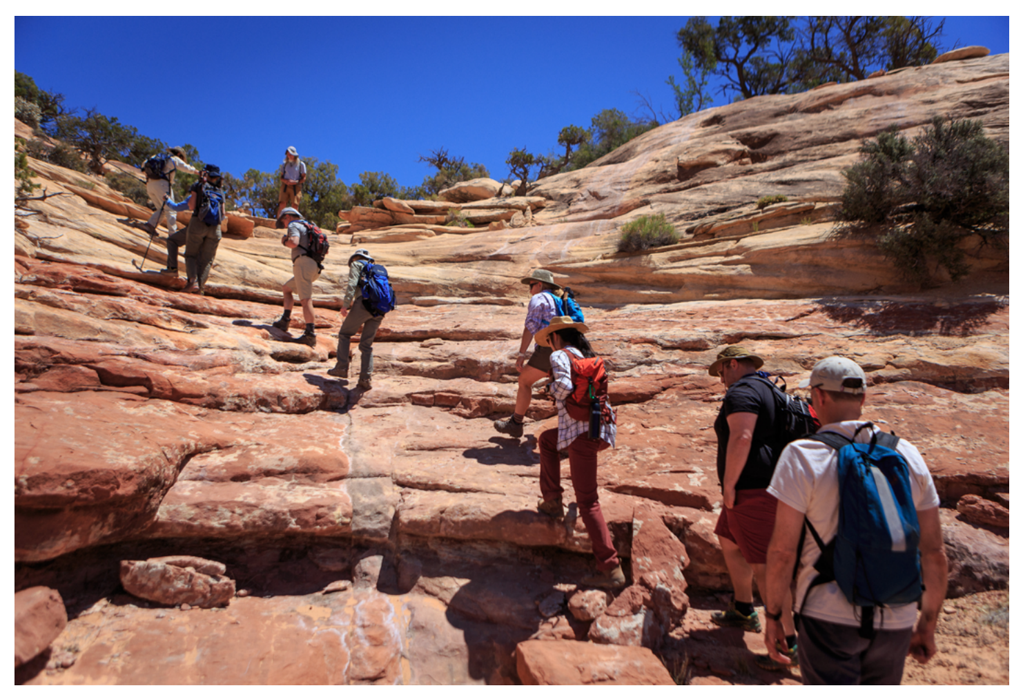
A 2018 donor trip to Bears Ears National Monument in Utah.